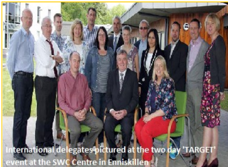
International delegates pictured at the two day 'TARGET' event at the SWC Centre in Enniskillen