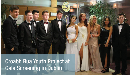
Croabh Rua Youth Project at Gala Screening in Dublin