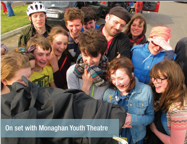
On set with Monaghan Youth Theatre