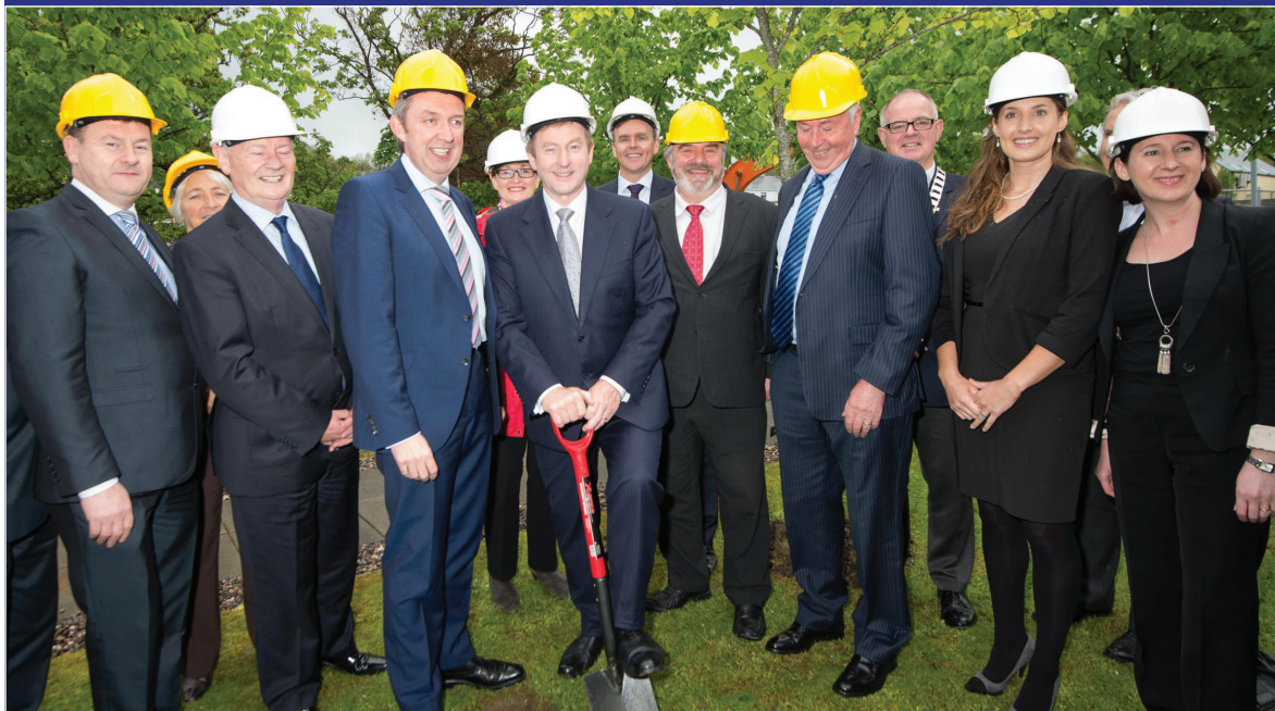
An Taoiseach, Enda Kenny, TD (centre) visited Letterkenny Institute of Technology recently to turn the sod on the North West Regional Science Park project, which is funded by the European Union's INTERREG IVA Programme.

For further information on the North West Regional Science Park, please visit www.lyit.ie