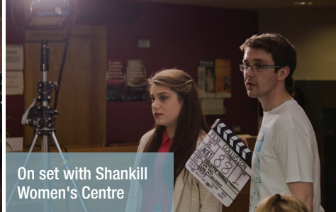
On set with Shankill Women's Centre