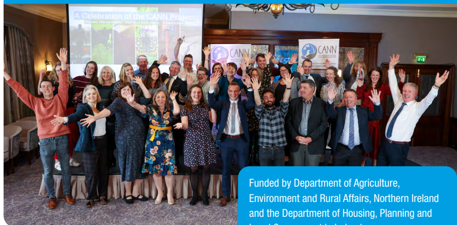
Staff at the CANN celebration following the project's success.

Funded by Department of Agriculture, Environment and Rural Affairs, Northern Ireland and the Department of Housing, Planning and Local Government in Ireland