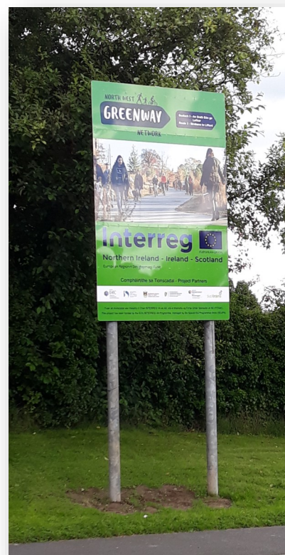
Pictured (right) new project sign in Lifford. Work is due to be completed in autumn 2021.