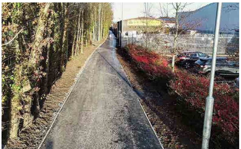
Work on the Strabane bypass is almost complete.

Match-funding for this project has been provided by the Department for Infrastructure, Northern Ireland and the Department of Transport, Ireland.