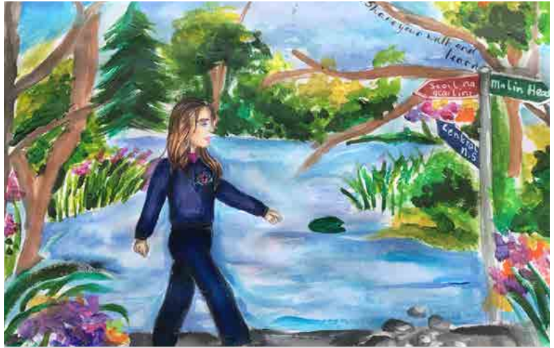
A poster produced by one of the CASE pupils involved in the Share the Walk Initiative.

As schools reach a determined number of km's/miles, they are invited to purchase trees which will be planted in the autumn in shared community spaces. These will be a collective reminder of the CASE project