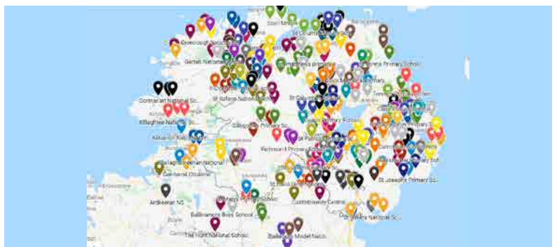
A virtual map of all the schools taking part in the CASE project. The team hope that all of the schools can one day take part in a virtual walk together.

Match-funding for this project has been provided by the Department of Education, Northern Ireland and the Department of Education and Skills, Ireland.