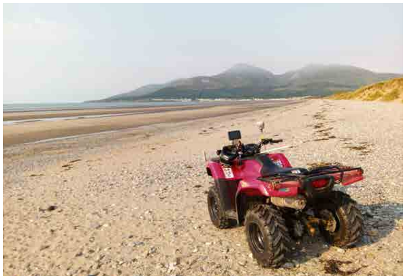
Regular surveys are being carried out on the stretch of shore between Newcastle and Dundrum to find out how, and why, our coastline is changing.

Match-funding for the MarPAMM project has been provided by the Department of Agriculture, Environment and Rural Affairs, Northern Ireland and the Department of Housing, Local Government and Heritage, Ireland.