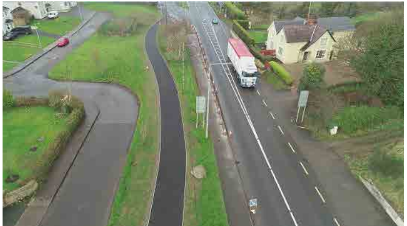
An aerial shot of a section in Lifford linking Murlog primary school to Strabane town centre.

This development falls under route three (Lifford – Strabane) of the €14.9m North West Greenway Network project.