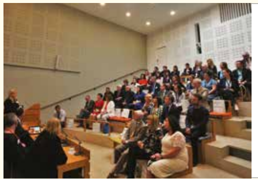
Audience members hear from a range of PEACE IV and INTERREG VA projects on the importance that EU funding has had.