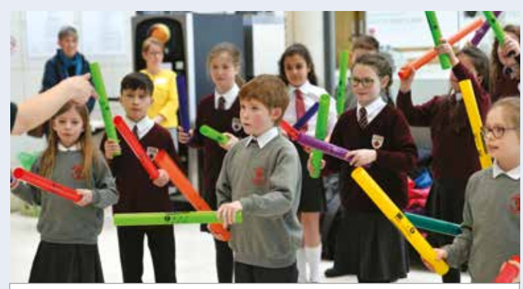
Children taking part in the recent launch event of the CASE project in the Market Place Theatre, Armagh.

Match-funding for the project has been provided by the Department of Education in Northern Ireland and the Department of Education and Skills in Ireland.