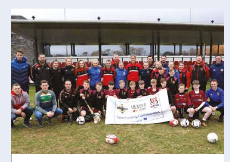
Sport Uniting Communities will utilise sport to promote positive relations and cultural diversity between almost 17,000 individuals of differing backgrounds.

Sport Uniting Communities will work to challenge the misconception that individual sports are for specific communities and will work to create a legacy in sport by; mentoring 180 clubs to become inclusive and welcoming community hubs, managing 360 volunteers through a development programme and training 180 young people through a Youth Leadership Programme.