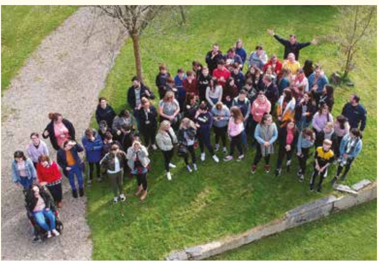
Young people and staff from the Peace Bytes project show off their drone photography skills at a cross-community workshop during Good Relations Week.

Match-funding for this project has been provided by the Executive Office, in Northern Ireland and the Department of Children and Youth Affairs, in Ireland.