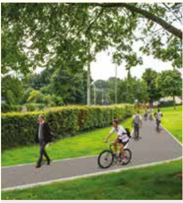
The anticipated view of Culmore Road following completion of works.