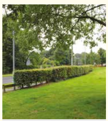
Culmore Road in Derry-Londonderry, part of route 2 as it currently looks.