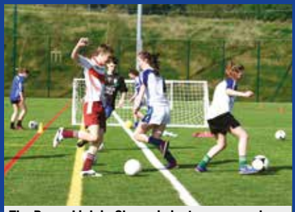
The Peace Link in Clones is just one example of a shared space project that has brought numerous benefits to the local community.

Looking forward, the organisation is entering into exciting new territory