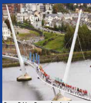
Peace Bridge, Derry - Londonderry

Looking forward, this investment will continue and support even more inspirational and important projects.