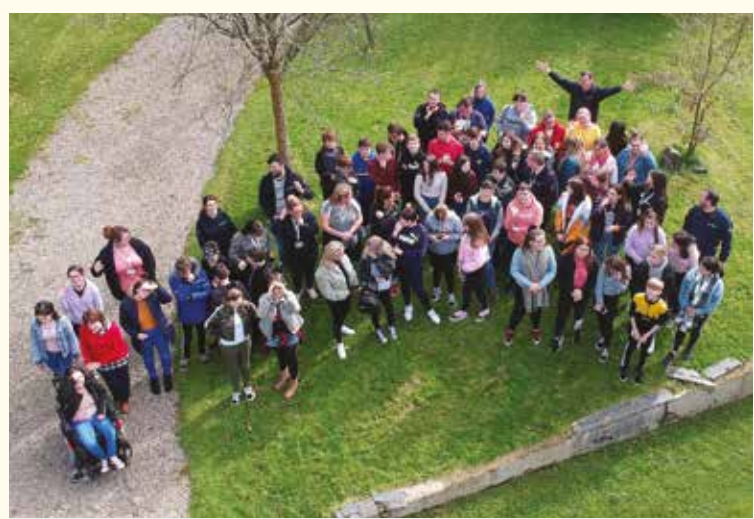
Young people and staff from the Peace Bytes project show off their drone photography skills at a cross-community workshop during Good Relations Week.

Match-funding for this project has been provided by the Executive Office, in Northern Ireland and the Department of Children and Youth Affairs, in Ireland.