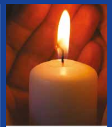
The PEACE Programme has provided support for thousands of victims & survivors of the troubles / conflict.

At the centre of its success has been its staff (some of whom have been present since the beginning). Dedicated, meticulous and hardworking, SEUPB employees are the heart and driving force of the organisation.