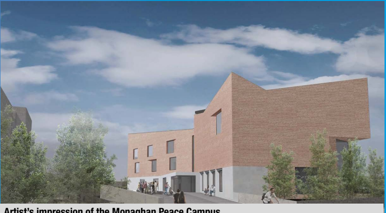
Artist's impression of the Monaghan Peace Campus.