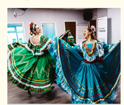
Dancers and a singer performing at the North West Belfast celebration event in the New Life Centre, Belfast on 16 January 2020.

Match-funding for this project has been provided by The Executive Office, Northern Ireland and the Department for Rural and Community Development, Ireland.