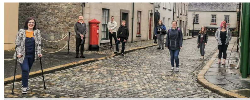
The new North Down group, who met face-to-face in September. The group will spend six months together working on different programmes and activities.