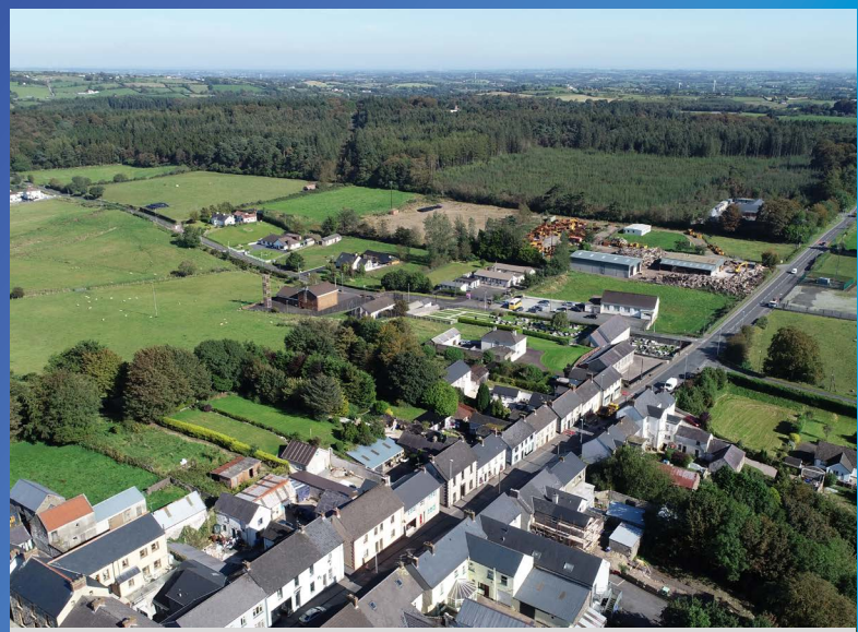
The village of Pomeroy, in County Tyrone, where the Connecting Pomeroy project will encourage greater levels of cross-community contact.

The new €8m Waterside Shared Village project will act as an example of good relations & peace and reconciliation development within the local area.