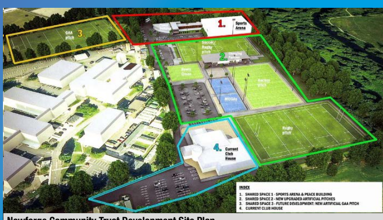
Newforge Community Trust Development Site Plan.

Located beside the River Lagan and Newforge Lane in South Belfast, the project will develop a 15-acre site which will be available to community groups and youth groups; schools; churches; sports clubs; and local residents on a cross-community basis. Led by Newforge Community Development Trust, the site was exclusively used by members of the RUC Athletic Association and Police Service of Northern Ireland for the past 60 years. The new plans will therefore transform the site as being accessible for all.