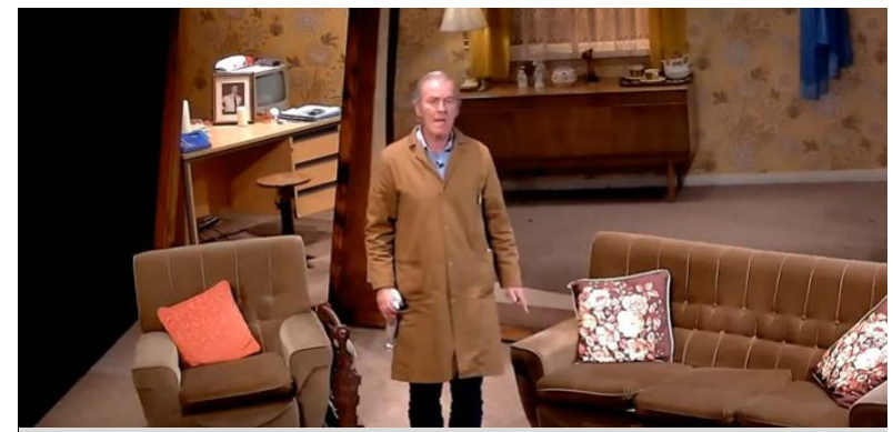
Snippet from the live performance of Anything Can Happen 1972, as part of the project's official closure event

As well as hosting the conference, the Playhouse decided to mark the closure by broadcasting the Anything Can Happen 1972 production live. Penned by Damian Gorman the play focused on the thoughts and feelings of those who lived through the Troubles. As part of the live performance the theatre specifically asked for contributions from anyone who had been affected by the Troubles. People were encouraged to send objects or photographs of significance or importance, to be placed on the 130 empty chairs in the theatre.