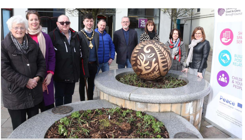
Causeway Coast and Glens Borough Council's special PEACE IV legacy video captures the programme activities over the projects lifetime, documenting participants' stories.

Match-funding for this project has been provided by the Executive Office, Northern Ireland and the Department for Rural and Community Development, Ireland.