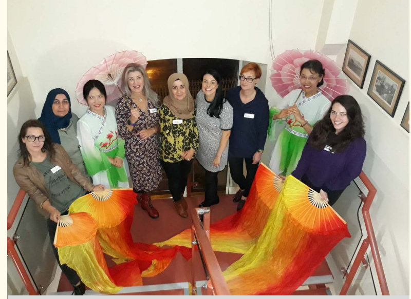
Some of the participants and artists at the Newry Celebration event on 7 October 2019, to mark the completion of the 10-week programme.

One of the participants from the group in Newry enjoyed the PRISM programme so much they implemented, on behalf of Newry Interchurches Forum, another 10-week programme with similar activities including two-day trips to Newcastle and Darkley House, County Armagh.