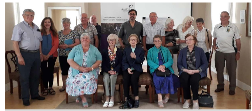
Participants on the Community Dialogue Circles Programme, who attended a Best Practice Visit to The Glenree Centre for Peace and Reconciliation.

As part of the history and heritage programme, young children aged 7-12 from the Carrickmore; Sixmilecross; Beragh and Omagh areas enjoyed a number of day trips which included the