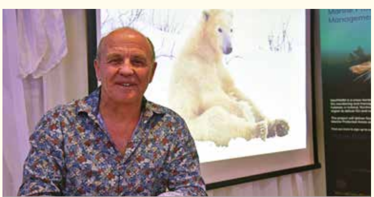
Doug Allan, cameraman of the UK's most-watched TV show of 2017, Blue Planet 2, launched the MarPAMM project by highlighting why marine protected areas matter.

Match-funding for this project has been provided by the Department of Agriculture, Environment and Rural Affairs in Northern Ireland and the Department of Housing, Planning and Local Government in Ireland.