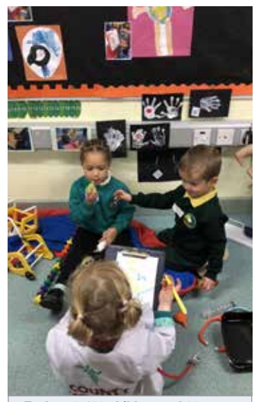
To date, 2,400 children and 82 pre-schools have been involved in the PEACE IV project.

Match-funding for the project has been provided by the Department of Education and Skills in Ireland and the Department of Education in Northern Ireland.