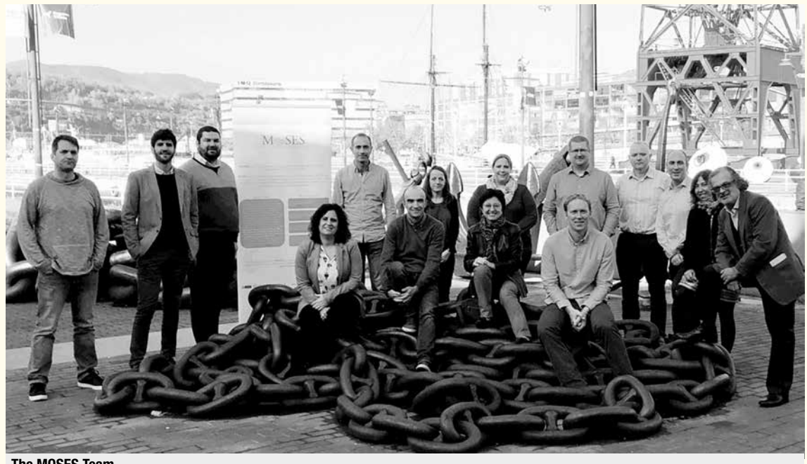
The MOSES Team.

Find out more about this project via: Website: http://mosesproject.eu/ Twitter: @atlanticmoses