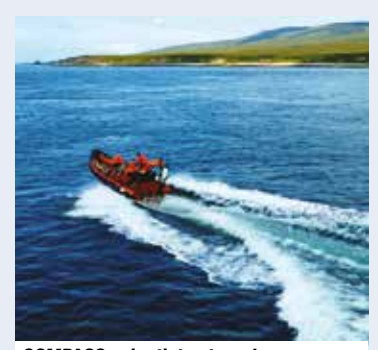
COMPASS scientists at work.

Legislation has moved towards an integrated approach to the