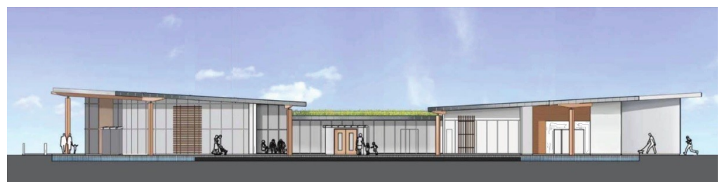
Riverine Building Artists Impression