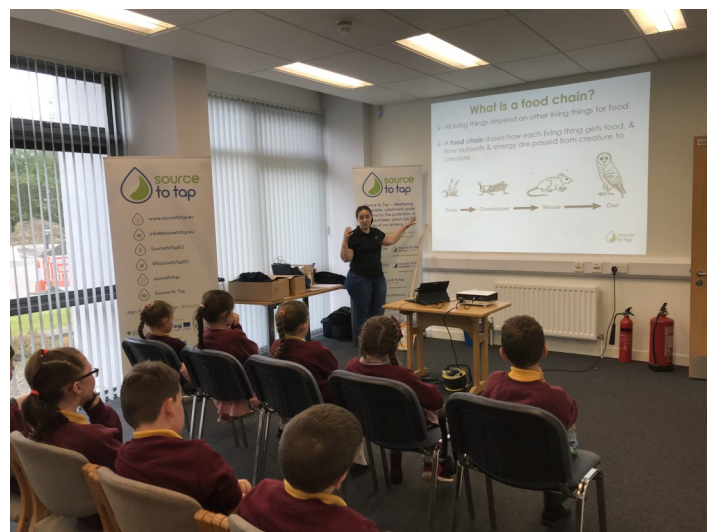
Source to Tap Project Officer raising awareness to local school children

Cross-border drinking water Sustainable Catchment Area Management Plan: Research and Pilot project: 1