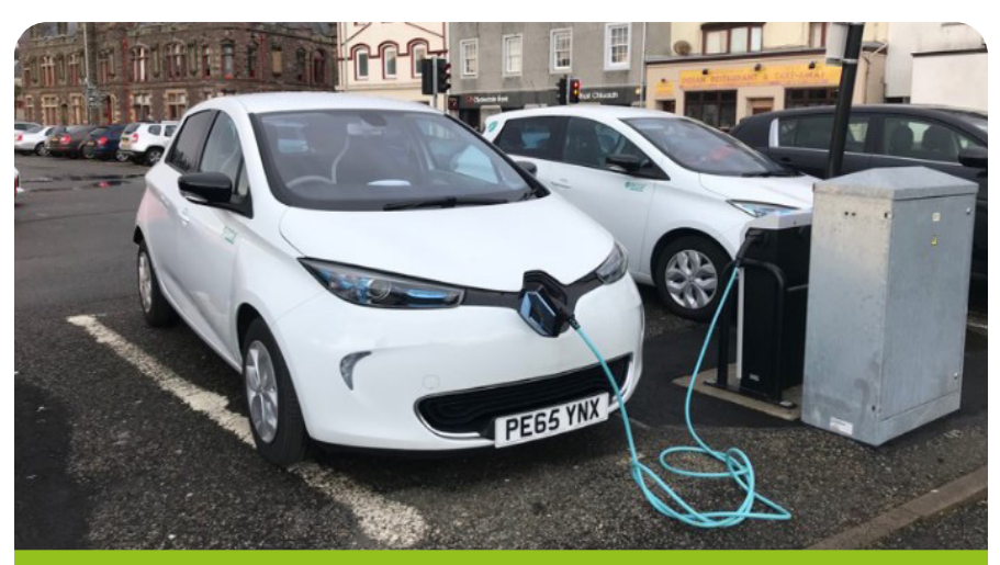
The FASTER project will provide 73 rapid charging points across Northern Ireland, the border counties of Ireland and Western Scotland.

The FASTER EV charging network will be installed on a phased basis over the next few years and will be supported by a series of public awareness and community