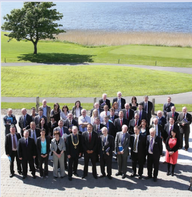
Minister for Transport, Tourism & Sport and Deputy Secretary of DETINI with representatives from ICBAN and the Border Regional Authority at the Launch of the 'Something for Everyone' brochure in the Lough Erne Golf Resort Enniskillen.

The idyllic setting of the Lough Erne Resort in Enniskillen was used to launch the 'Something for Everyone' brochure by the Irish Minister for