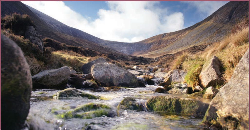
A landscape view of the area promoted by the project.

For more information on the project please visit www.mournecooleygullion.com