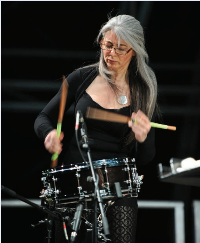
Dame Evelyn Glennie performs at the Sensonic Event in Derry/Londonderry.

These people have been involved in the CAWT Citizenship for People with Disabilities project, which aims to promote the social inclusion of people with disabilities. Many of these participants were present at the event 'Doing it Differently - Showcasing Best Practice Towards the Inclusion of