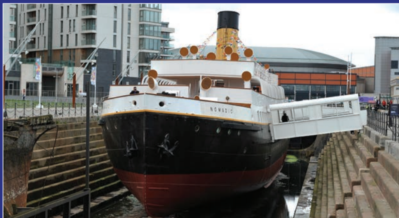
View of the SS Nomadic, in its berth at Hamilton Dock behind the Odyssey.

Further information on the restoration of the ship and on how to book visits is available at www.nomadicbelfast.com .