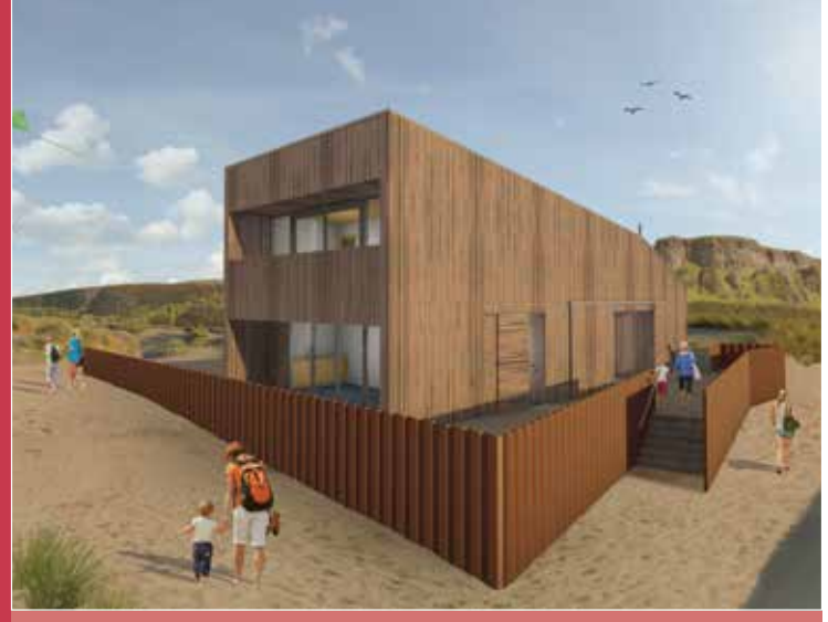
An artist's impression of the planned Beach Activity Centre at Benone Strand.

The new beach activity centre will be developed on the footprint of the existing building at the beach entrance road and will provide new toilets,