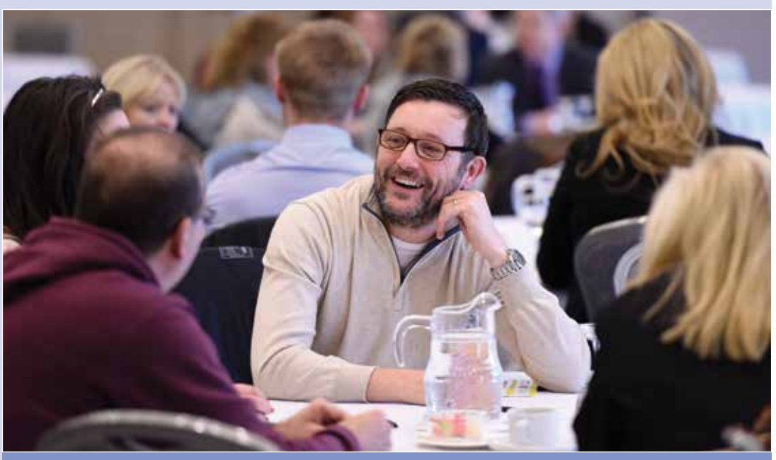
One of the many attendees at the recent series of Pre-Application Workshops, hosted by the SEUPB in Northern Ireland, the Border Region of Ireland and Western Scotland.

A new bi-lingual TV and Radio documentary series which documents previously unheard voices and stories about the conflict in Northern Ireland was launched recently at Belfast City Hall.