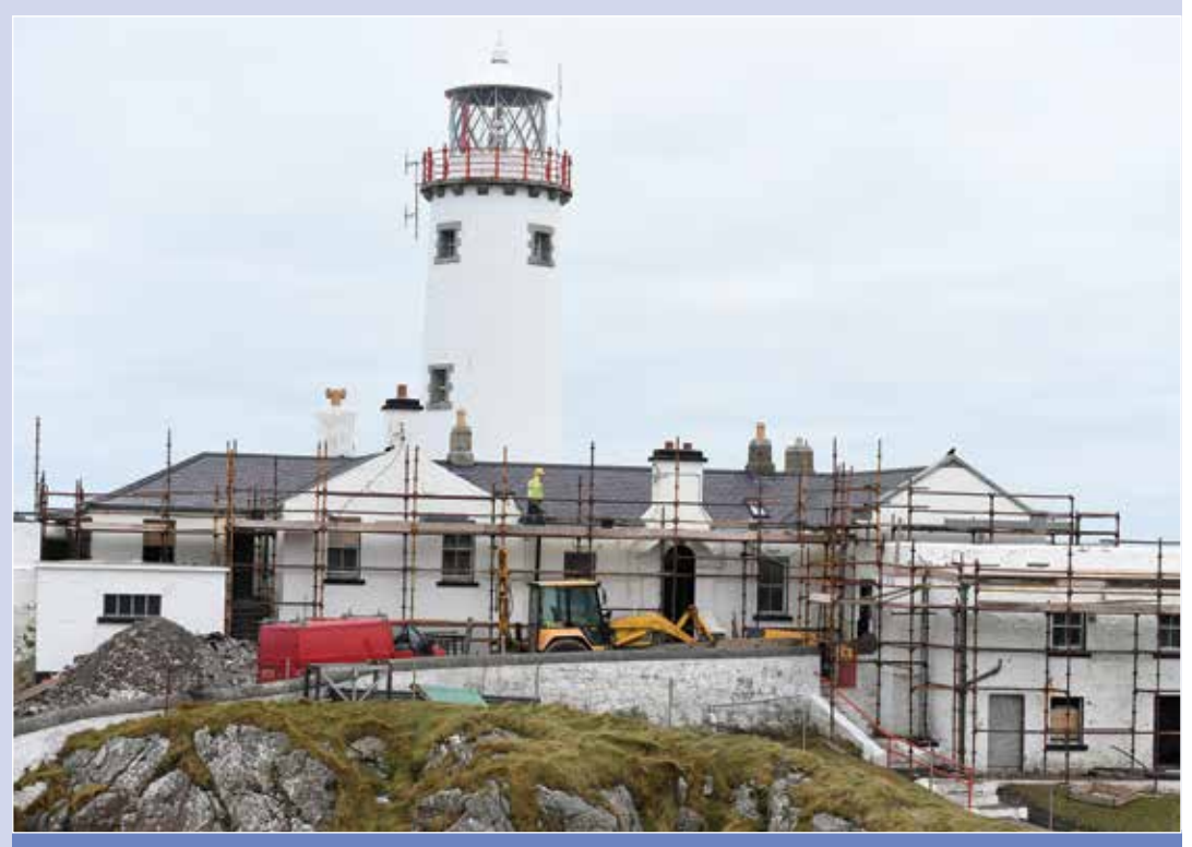
Refurbishment works underway at Fanad Head Lighthouse, Co. Donegal as part of the INTERREG-funded 'Great Lighthouses of Ireland' project.

For further information on the Lighthouse Tourism Trail, please visit http://bit.ly/1Hkjbw2