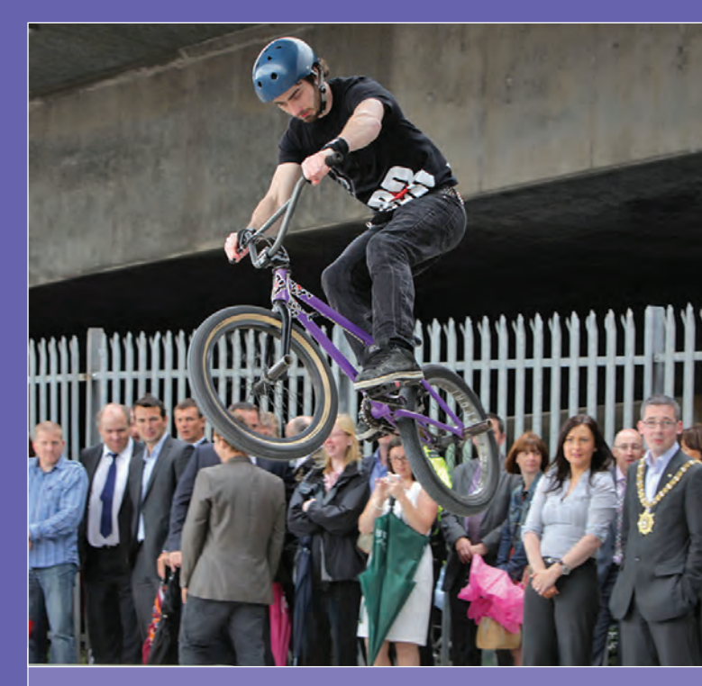
A demonstration of BMX at the opening of the new Bridges Park.

For more information e-mail urbansports@belfastcity.gov.uk or visit the Council's website at www.belfastcity.gov.uk/urbansports