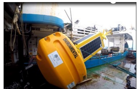
Loch Ewe buoy